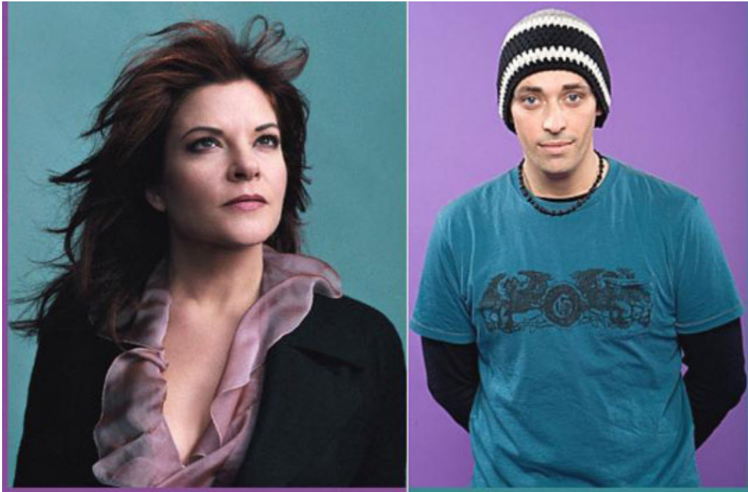
ROSANNE CASH and PHIL STACEY

Phil Stacey, the popular “American Idol” finalist, grew up listening to southern and contemporary music in his family home headed by his pastor father. He interrupted a budding country music career to enlist in the Navy following 9/11 and competed in American Idol as an active member of the service. His debut recording, self-titled “Phil Stacey,” was recently released by Lyric Street Records.