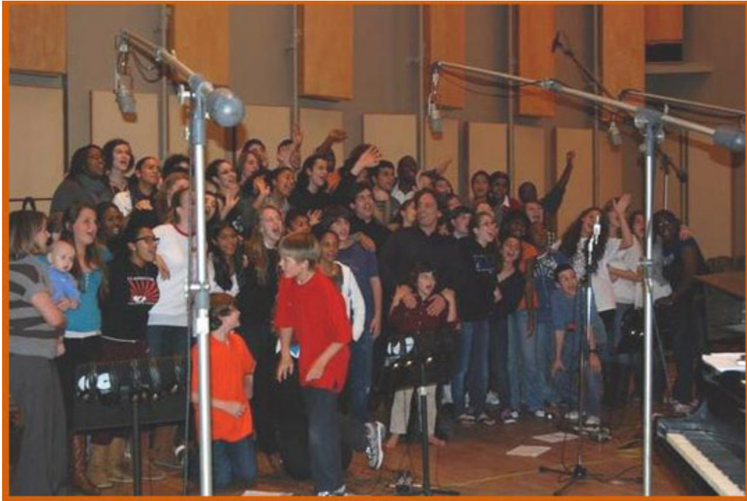
YPC – The Young People's Chorus of New York City